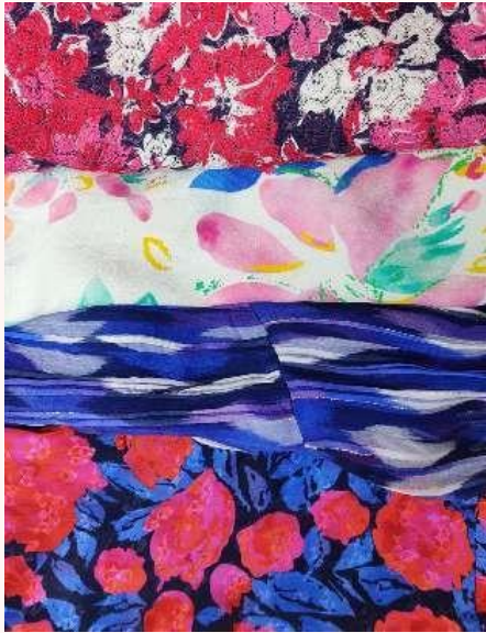
PRINTS & SURFACING